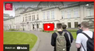
Student campus tour - 1.38 mins