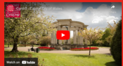
Cardiff - Capital of Wales - 1.35 mins