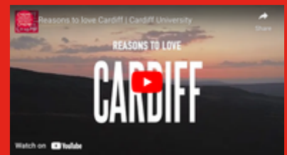
Reasons to love Cardiff - 1.05 mins