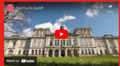
See you in Cardiff - 2.42 mins