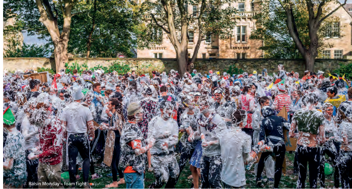
Raisin Monday – foam fight