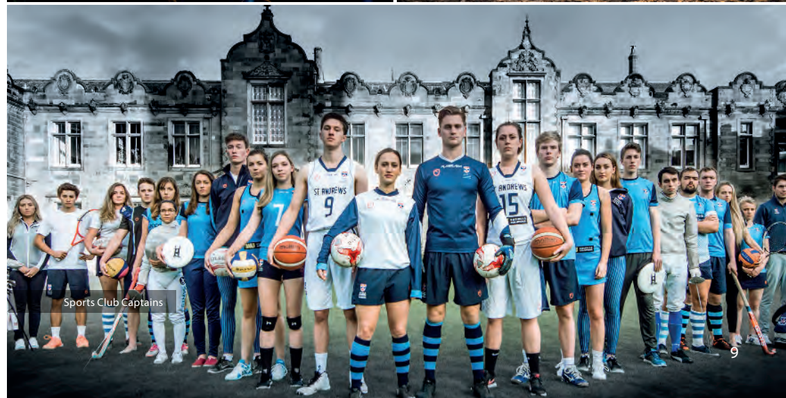
Sports Club Captains