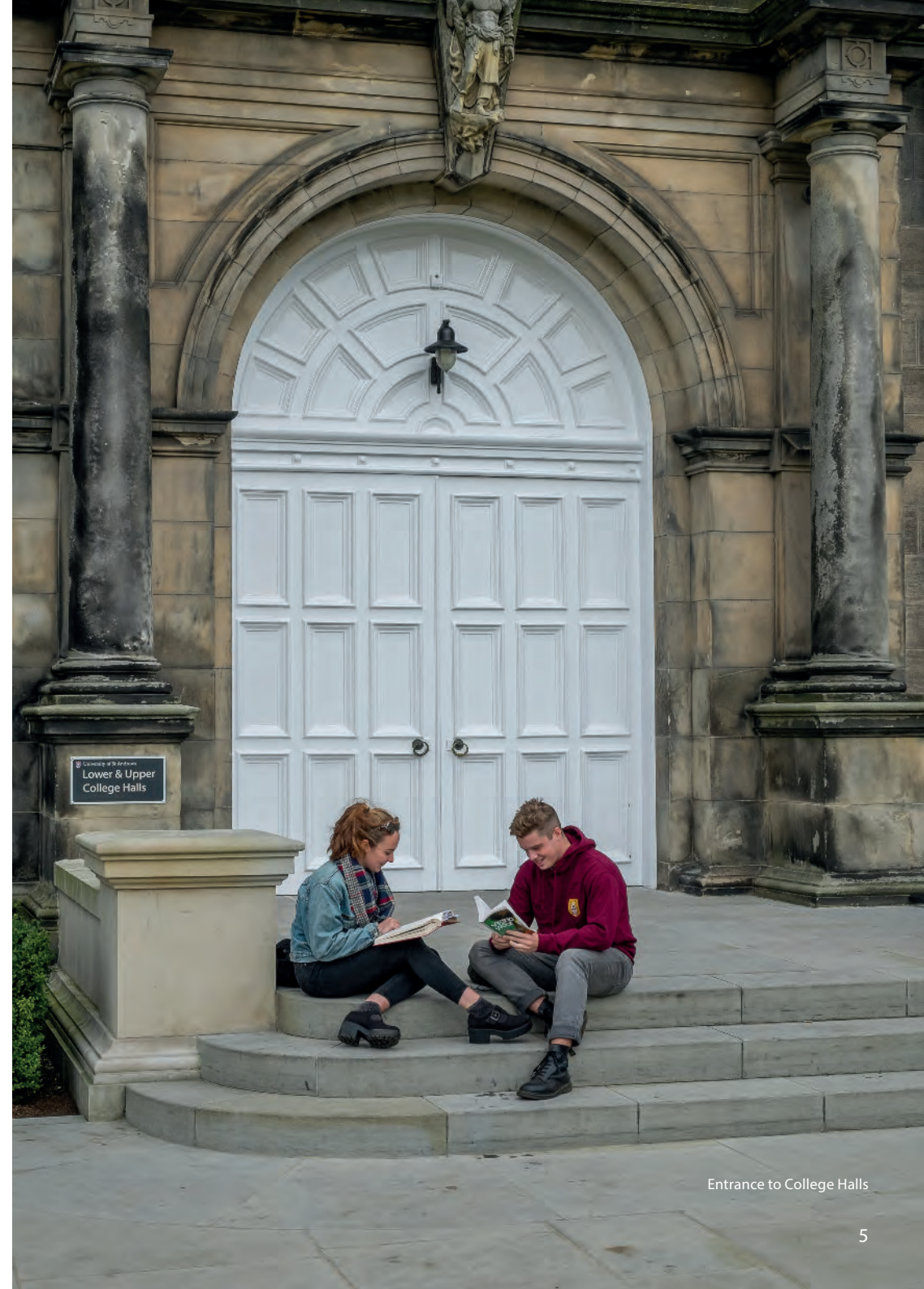
Entrance to College Halls

Students who meet the minimum English language entry requirement, and who would like to boost their English language skills , should consider attending a pre-sessional English language course: www.st-andrews.ac.uk/international-education/short-courses/pre-sessional