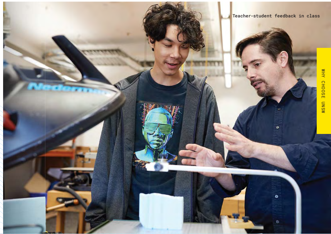
Teacher-student feedback in class