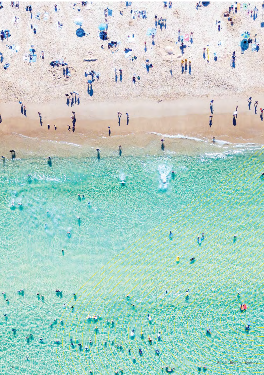
Bondi Beach, Sydney