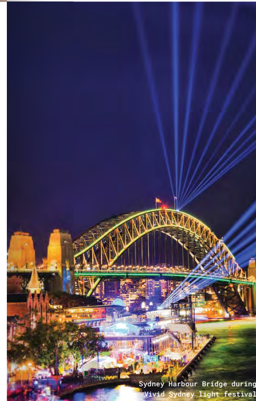
Sydney Harbour Bridge during Vivid Sydney Light festival