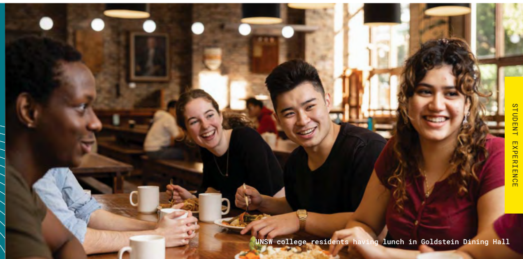
UNSW college residents having lunch in Goldstein Dining Hall

➤ Find the home that is right for you. Take 360 virtual tours of rooms and compare prices at accommodation.unsw.edu.au