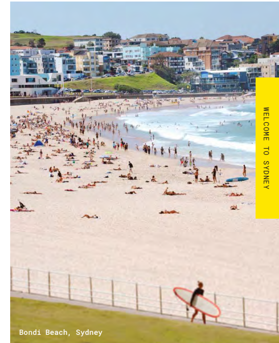
Bondi Beach, Sydney

Or if you are more into sport, we host world-class sporting events including cricket, soccer and rugby. For the more artistic visitors, there are theatre productions, concerts and festivals (many of them free!) to keep you entertained and inspired all year round. Get among it and join the fun in Sydney.