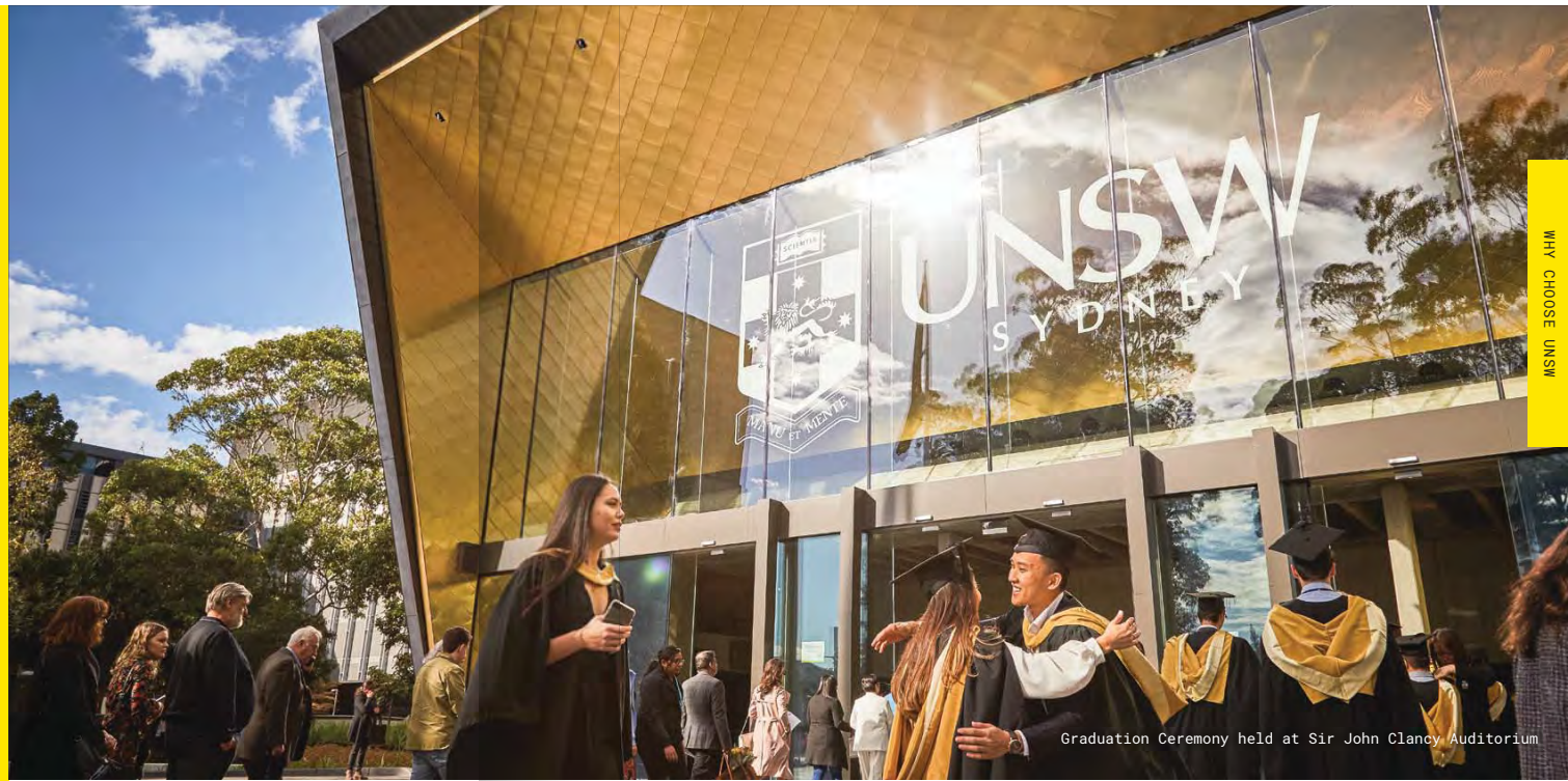
Graduation Ceremony held at Sir John Clancy Auditorium