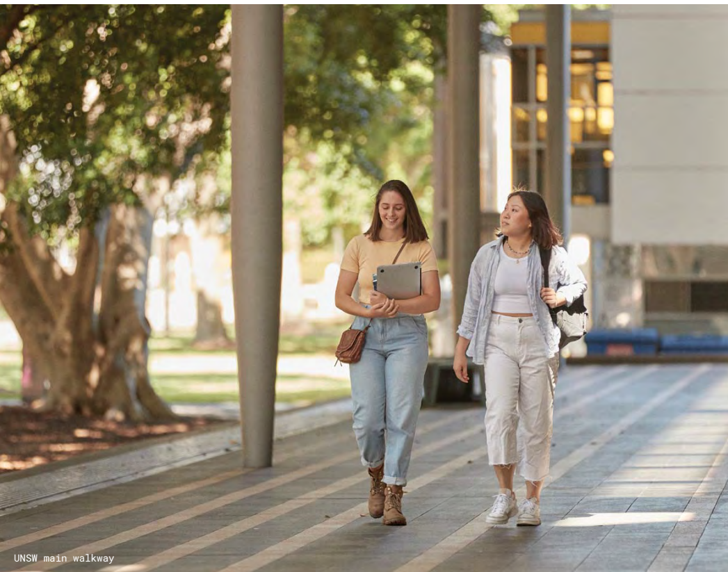
UNSW main walkway