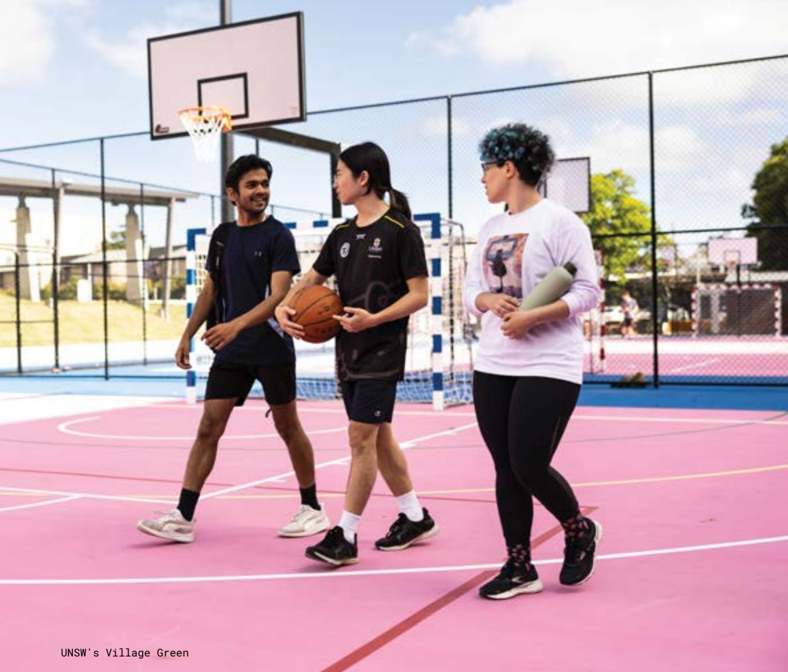
UNSW's Village Green